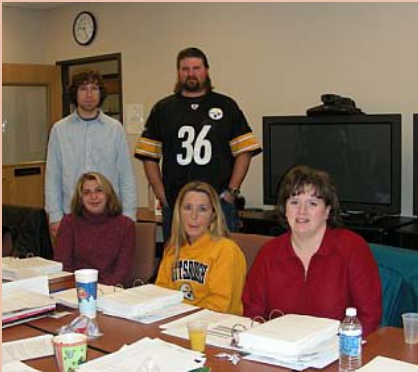
Pictured above: Instructor class who are now certified to teach Work Certified program.

The national work readiness program, Work Certified , is in its second cycle of class sessions in Armstrong, Butler, and Indiana Counties.