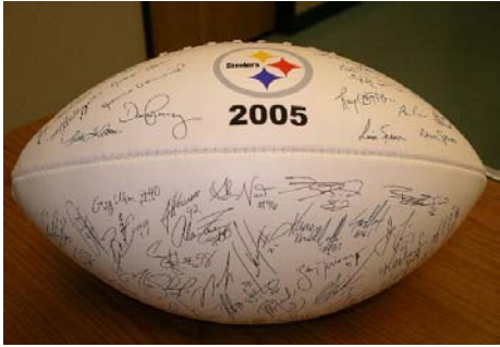
This signed 2005 Steeler's Football is one of the items in the Sports Memorabilia Silent Auction.

Steelers team and coaches. Tickets are $15 for adults, $8 for students, and $5 for children 12 and under. Tickets are limited, so call the Trust today to get yours! (724) 543-2599