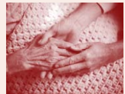
THE COMPASSION TO CARE, THE LEADERSHIP TO CONQUER

For more information or to register, contact the Trust at (724) 543-2599